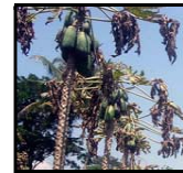
Papaya mealybugs on papaya