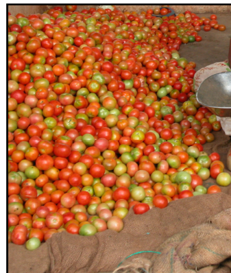
Tomatoes in India

Tomato, a common vegetable crop grown around the world and one that many IPM CRSP projects are working with, has had a scientific name change. In 2006, it was changed from Lycopersicon esculentum to Solanum lycopersicum .