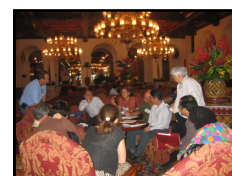
IPM CRSP workshop