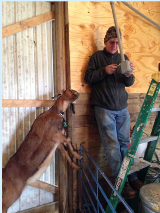
The Prentice (as in Roy) Instructs His New Apprentice on the Fine Art of Wiring