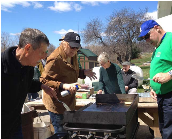
Pancake Chefs in the Outdoor Kitchen

Recently, the Tollgate volunteers have been checking our many bird boxes in the back fields. Bluebirds, swallows and wrens have taken up residence in several of the boxes already. We have also been seeing an osprey hanging around the pond the last few days. We once saw him even make off with a fish! The first new family of geese was sighted on the pond (great). Perhaps, in a sign of avian bonding, the osprey and geese family could have a little get-together.