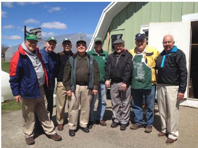
The Maple Syrup Crew