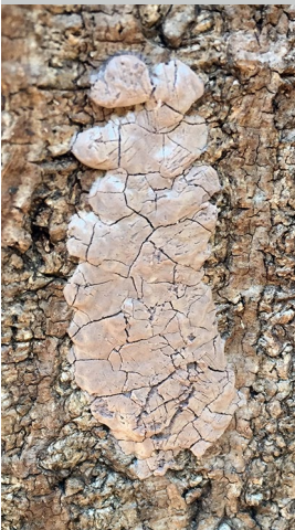
Mass with some eggs hatched.