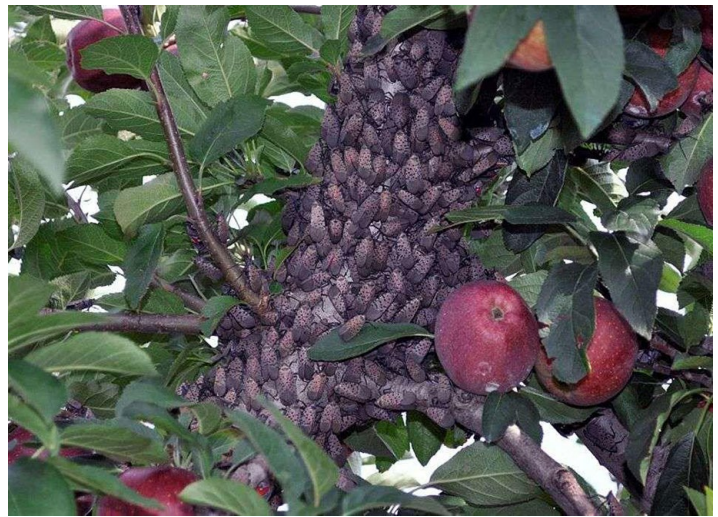
Erica Smyers, Penn State University.

The greatest economic impacts of SLF may result from its ability to feed on many types of crop plants. Tree hosts of SLF include apple, plum, cherry, peach and apricot. High densities of SLF have also been observed on grape vines and on hops vines. Neither the immature nor adult SLFs feed on the fruits themselves, but large numbers of insects feeding on these plants during the harvest season can affect fruit quality. The insects remove significant amounts of sap and the sooty mold can contaminate berries. This can reduce marketable yields, delay fruit ripening and reduce winter tolerance to cold weather.