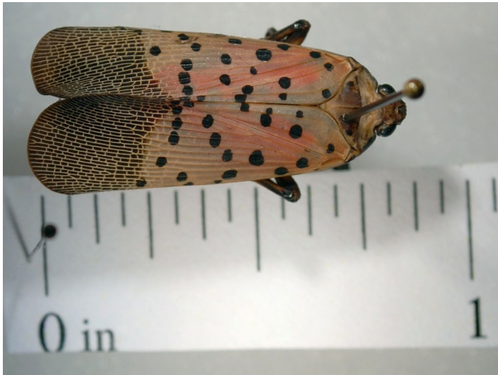
Adults are about 1 inch long and show little of the red color when wings are closed.

After mating, adult females lay eggs, usually beginning in September and continuing through November or even early December. Eggs overwinter until the following April or May, when the first instar nymphs hatch and begin feeding.