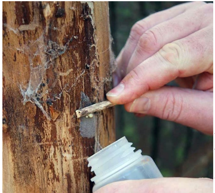
Scraping a spotted lanternfly egg mass off a tree.

Egg masses that are accessible can be scraped off and destroyed, eliminating insects that would otherwise hatch and feed. Use a stick, plastic card, putty knife or similar tool to scrape eggs into a