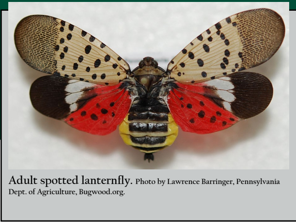
Adult spotted lanternfly.