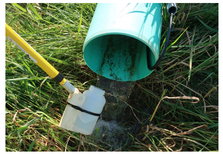
Figure 3- Grab sampling from the subsurface drainage discharge.

Collecting daily grab samples throughout the entire event flow can be challenging, so longer sampling intervals are sometimes used. The error of a grab sampling strategy, that does not cover every day of the event flows, can be even greater than those reported in this section. Because of the high error of the grab sampling, it is important to report the uncertainty of the annual P load estimation.