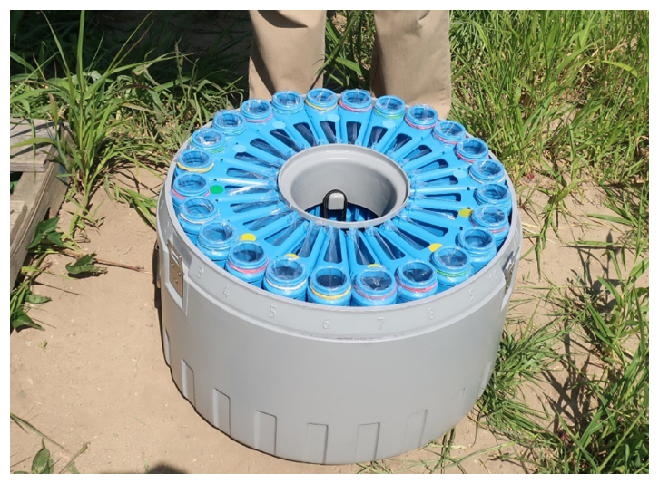
Figure 1- An automated sampler can perform flowproportional or time-proportional sampling.

For estimating the annual P load, you can use flow-proportional compositing for both drainage discharge and surface runoff. This strategy needs an automated sampler and a flow rate sensor to trigger the sampling (Figure 1). In this method, the sampler takes an aliquot when a certain flow depth has occurred. Flow depth is flow volume divided by drained area (defined as flow depth interval). Then, the sampler pumps the aliquot into a bottle. The decision of the aliquot number depends on the volume of the aliquot, capacity of the bottle, and project budget.