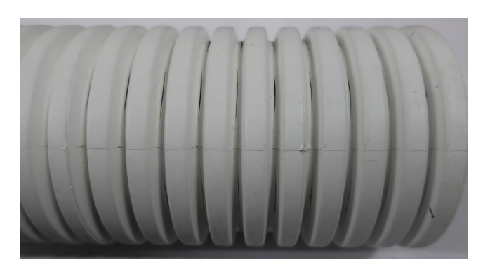
Figure 1- Left: A 4-inch regular-perforated drain pipe wrapped with a knitted-sock envelope to prevent drain sedimentation. Right: A 4-inch sand-slot drain pipe with narrow-slot width to prevent drain sedimentation.