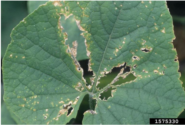
Figure 9 Cucumber Beetle damage on foliar leaf. Gerald Holmes, Strawberry Center, Cal Poly San Luis Obispo, Bugwood.org ( https://www.ipmimages.org/browse/detail.cfm?imgnum=1575330 )

Feeding on flowers can reduce fruit production, and direct feeding on fruits causes scars and pockmarks, which decrease marketability of fruits. The primary economic impact occurs when beetles vector bacterial wilt disease ( Erwinia tracheiphila ) among cucurbit plants. Plants suffering from this disease wilt in a patchy fashion as the disease spreads, with some leaves looking healthy while others wilt. There is no cure for the disease. Management relies on control of the beetle. Striped cucumber beetles have two generations per year in Michigan. (Buchanan et al, 2017, May)