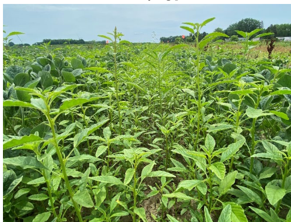
Figure 4. Waterhemp in soybeans.

You notice weeds are starting to break all over your Roundup Ready soybean field (Figure 4). It's only been a few weeks since your pre-emerge herbicide application, but you can tell it's had poor efficacy. The soybeans have also only recently emerged, and you know they won't grow fast enough to outcompete the established weeds. Because there is a wide variety of weed species in the field, you decide a broad spectrum herbicide is your best option. You select Roundup PowerMax (glyphosate) as the best choice for managing the weed populations since it's labeled to eliminate the weeds you've identified.