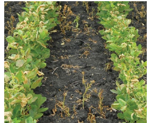
Figure 7. Cobra (lactofen) damage to soybeans.

When you apply the herbicide, you leave a tiny, untreated portion of the headland. The untreated area allows you to collect waterhemp seed samples for herbicide resistance testing. True to the label, when you return to the soybeans a week later, there is bronzing, speckling, and some necrosis on the upper soybean leaves (Figure 7). Most importantly, damage is obviously visible on the waterhemp as all the leaves are necrotic and wilted, and only some stems have a little bit of green left in them. You return over the next couple of days to ultimately assess that you achieved sufficient waterhemp control.