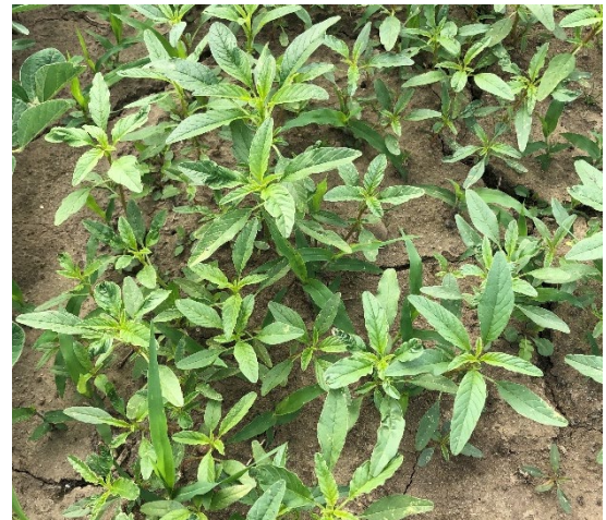
Figure 5. Dense waterhemp 2-4" tall.

resistant to glyphosate. You also would like to know for sure if you have glyphosate-resistant waterhemp in your fields. However, you can only send seed samples to the MSU Plant and Pest Diagnostics Lab (www.canr.msu.edu/pestid/). To collect seeds, you'd have to wait a couple of months until the weeds mature and produce them. In the meantime, you also need to kill the waterhemp as soon as possible. It is already two inches tall and will soon be too tall to control (Figure 5).