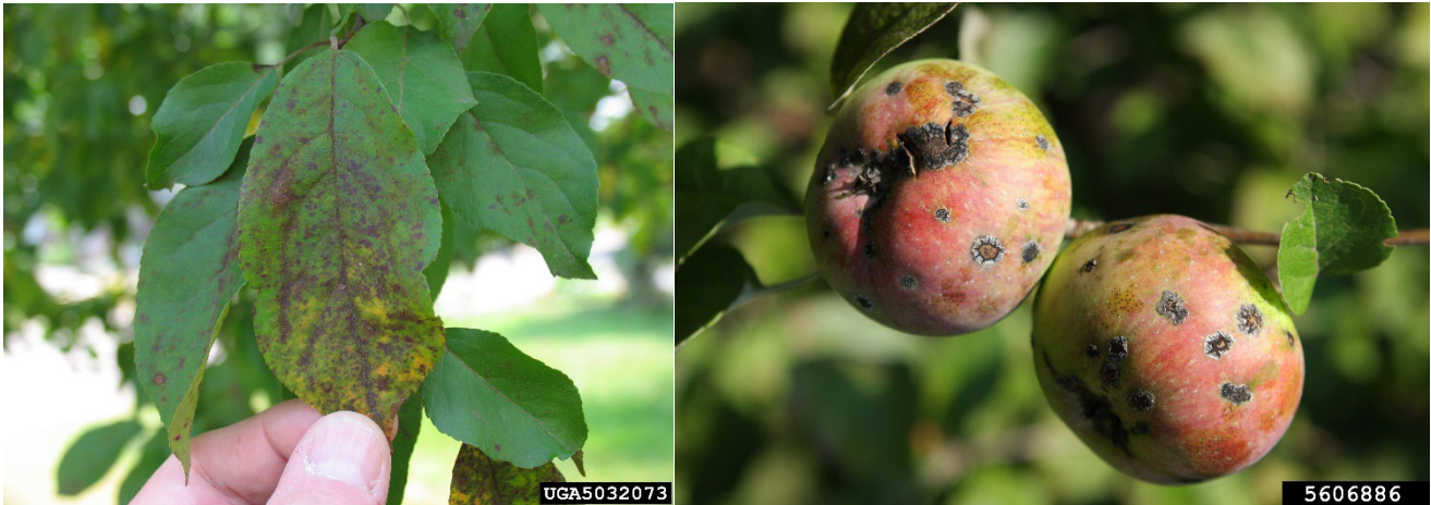
Figure 2. Apple scab lesions on leaf and fruit.

Developing and Educating Managers and New Decision-makers