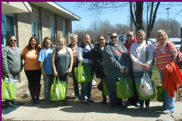
These participants had just completed 10 hours of training through Coking Matters for Child Care Providers series.