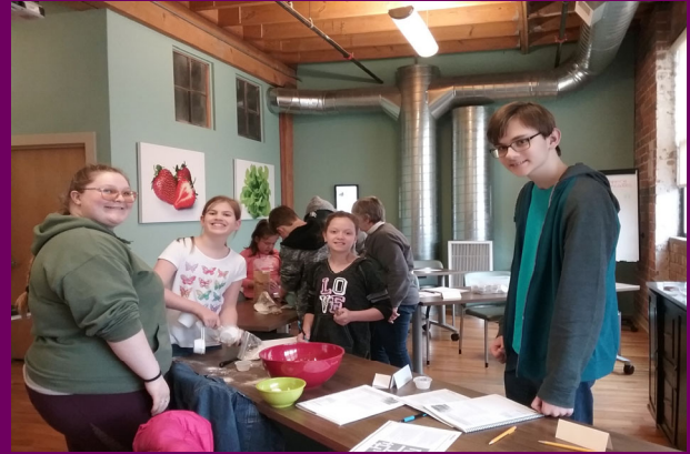
Cooking Matters for Teens at Memorial Healthcare Community Wellness, Nutrition, and Diabetes Center. These teens are learning about nutrition and cooking skills.

Participants consistently reported higher self-confidence following the class. For example, confidence in knowing how to measure blood sugar levels and use those readings to make appropriate food and activity adjustments increased by 34% following the class. Confidence in using problem-solving skills when something unexpected arises that affects control of diabetes increased by 36% following the class. Confidence in the ability to lower chances of developing diabetes-related health complications by controlling diabetes increased by 31%. Having coping skills that help reduce the negative emotional impact of living with diabetes increased by 34% after the class.