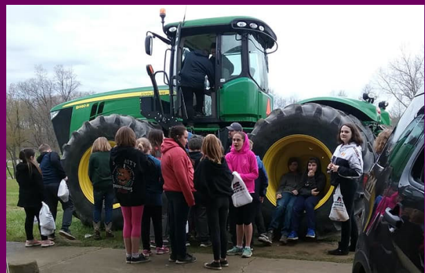
MSU Extension Participates in Farm Safety Day. Partnering with Farm Bureau for area fifth graders at the Shiawassee County fairgrounds