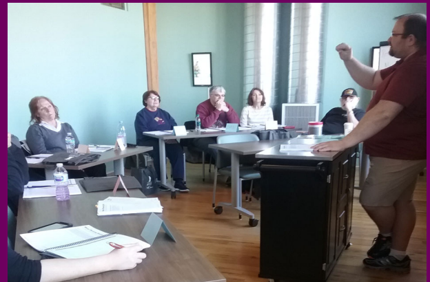
Teaching nutrition to a class at the Memorial Healthcare Community Wellness, Nutrition and Diabetes Center.