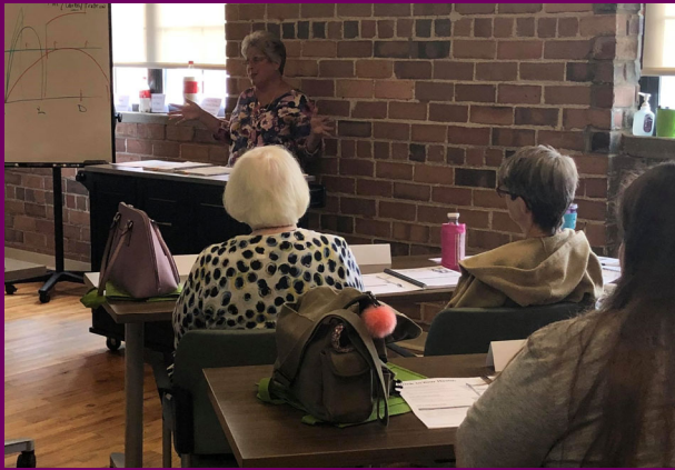
Cooking Matters classes being taught at Memorial Healthcare Community Wellness, Nutrition and Diabetes Center.

In 2018, MSU Extension's Community Nutrition Instructors had the opportunity to collaborate with various partners throughout Shiawassee County teaching a program called SNAP-Ed. SNAP-Ed is an evidence-based program that helps people lead healthier lives. The program teaches people using or eligible for SNAP assistance about good nutrition and how to make their food dollars stretch further. SNAP-Ed participants also learn to be physically active. In 2018 Instructors worked with 126 adults and 988 youth who participated in an up to 6 week series of educational sessions. There were 2,087 individuals that participated in one-time presentations