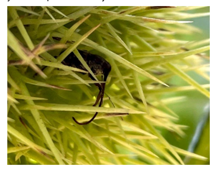
Figure 5. Adult female chestnut weevil ovipositing through the bur of a chestnut into the kernel.

After feeding, the females pivot, extend their ovipositor into the hole in the kernel then lay several eggs just inside the shell of the nut (Figure 4E-F; Figure 5). These eggs hatch in one to two weeks and the white or cream-colored larvae (Figure 2) feed on the kernel for approximately five weeks (Figure 4G). Mature larvae chew circular exit holes through the shell of the nut (Figure 4H) then drop to the ground and burrow into soil. If nuts have already been harvested, however, larvae will still chew an exit hole and emerge from the nuts. Once larvae are in the soil, they construct smooth-walled pupal chambers (Figure 4I) where they will remain for several months. Most larvae will pupate the following fall (Figure 4K) then emerge from the ground as adults, coinciding with bur and kernel development. A portion of the weevils, however, remain underground through a second winter. These insects will pupate and emerge from the soil as adults the following year in late spring or early summer, typically congregating on blooming catkins (Figure 4J). This two-phased underground diapause (dormant period) results in a biennial cycle of weevil density in orchards, with high and low populations occurring in alternate years. In Michigan, weevil populations are consistently higher in odd years compared to even years.