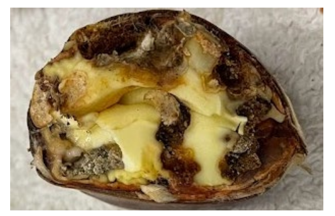
Figure 1. Chestnut weevil larval feeding damage.

In recent years, an increasing number of Michigan chestnut producers have experienced serious damage from the lesser chestnut weevil ( Curculio sayi Gyllenhal). This native insect likely evolved with American chestnut ( Castanea dentata ) but is now an important pest in chestnut orchards in many eastern states.