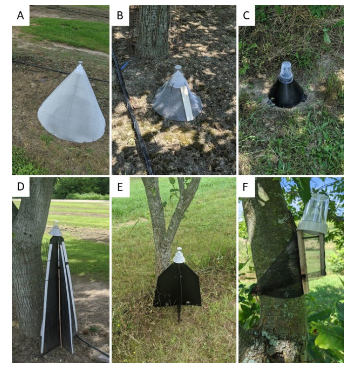
Figure 6. Two general types of commercially available traps can be used to capture chestnut weevils. Emergence traps (A–C) are designed to capture adult weevils as they emerge from the ground while activity traps (D–F) may capture adult weevils as they move about between trees (D, E) or up trees (F; circle trap). No lures to attract chestnut weevils to traps are available, which limits trap efficacy.

Homemade and commercial traps to monitor emergence or activity of adult chestnut weevils (Figure 6) are available. There are no commercially available lures to attract weevils to the traps, however, and none of the traps are highly effective at capturing adults.