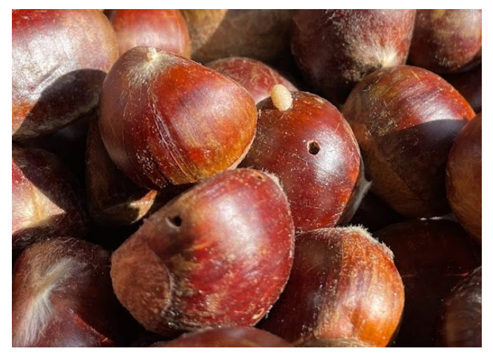
Figure 7. A weevil larva emerging from a chestnut (upper center). Emergence holes left by other larvae are also shown.

High or even moderate densities of chestnut weevils can become a serious problem within commercial orchards. Unmanaged weevil populations can infest more than 60% of harvested chestnuts and a few growers have reported losing 90% of their harvest due to weevil feeding. Larval feeding along with the frass excreted by larvae inside chestnut kernels renders the nuts foul and unmarketable (Figure 1). It can be even more problematic if larvae emerge after consumers have purchased fresh chestnuts (Figure 7). Weevil larvae crawling across a marketplace shelf or a countertop can ruin the appeal of fresh chestnuts for consumption or future purchases.