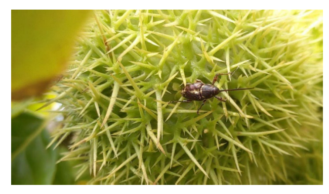
Figure 3. Adult female chestnut weevil on a chestnut bur in autumn.

Adult female weevils use their specialized mouthparts at the end of their long snout to chew a hole through the bur and shell of the chestnut into the kernel. This leaves small black bruises on the shell of the nut (Figure 4C-D).