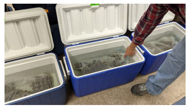
Figure 8. Water curing chestnuts in 30-gallon ice chests. Chestnuts were placed into plastic mesh bags and submerged for 7 to 9 days in room temperature water.

Water curing is a simple treatment that was traditionally used to kill weevils and other pests in harvested chestnuts. This process involves submerging chestnuts in room temperature water and allowing a partial lactic fermentation process to occur over the course of 7 to 9 days. After submersion, chestnuts can be dried for several hours then refrigerated until sold. This treatment requires no expensive equipment and can be a practical tactic for hobbyists and small producers. We performed this treatment, for example, using standard 30-gallon ice chests (Figure 8).