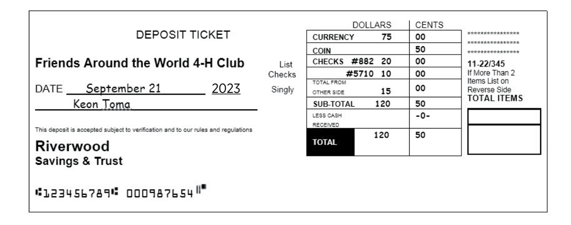
Figure 7. Sample of a Completed Deposit Ticket or Slip.

Access to the funds may not be immediately after the check is deposited. Check with the financial institution regarding its policy.