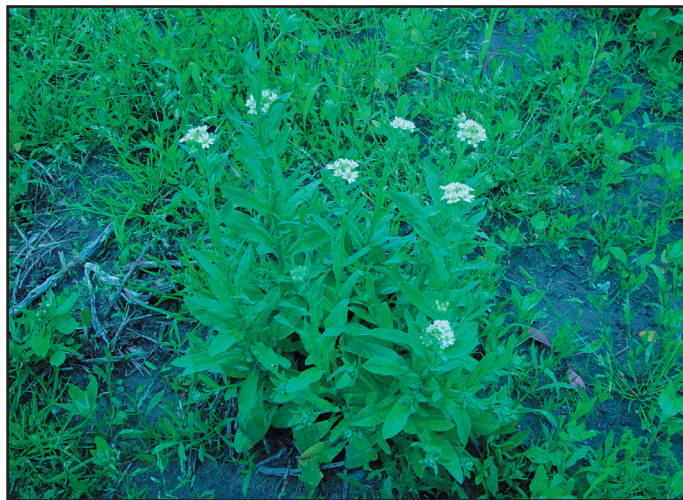
Photo 1. Mature hoary alyssum plant.

Researchers at the University of Minnesota have reported that ingestion of hay containing a high level of hoary alyssum can cause horses to experience depression and “stocking up”, or swelling of the lower legs. Fever and short-term diarrhea may also accompany consumption of this plant. These symptoms can usually be observed 12 to 24 hours following ingestion of hoary alyssum. Symptoms normally subside 2 to 4 days after the source is removed.