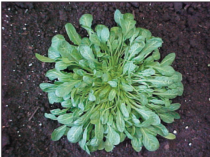
Photo 2. Hoary alyssum rosette.

The clinical signs are milder when ingesting lower percentages of this plant. It is recommended that hay containing greater than 30% hoary alyssum not be fed to horses.