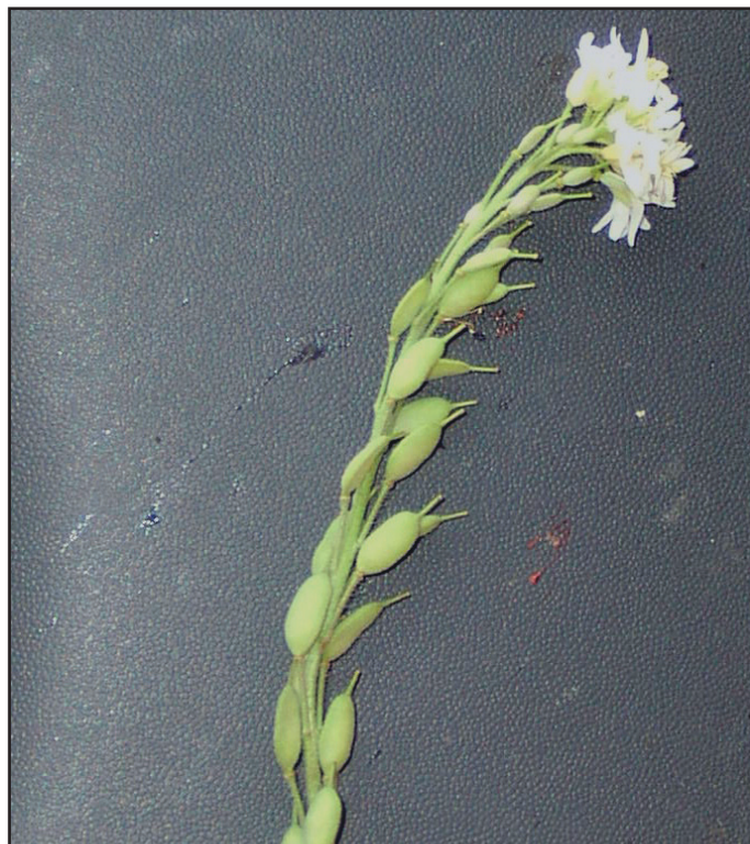
Photo 4. Seed pods of hoary alyssum.

These hairs give the plant a pale-green coloration. The name “hoary” denotes the rough hairs on the stems, leaves, and fruit. Hoary alyssum has numerous white flowers with four deeply divided or notched petals (Photo 3). Seed pods are round to oblong in shape (5 to 9 mm long, 3 to 4 mm wide), slightly flattened, hairy, and swollen with a short beak or point on the end (Photo 4). The seed pods are usually held close to the stems.