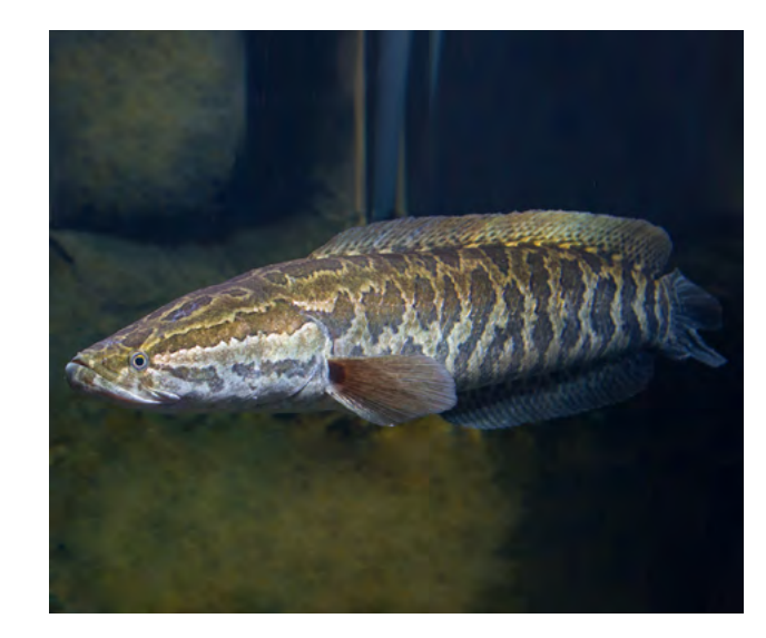
Northern snakehead | Channa argus

Other names: amur snakehead, eastern snakehead, ocellated snakehead